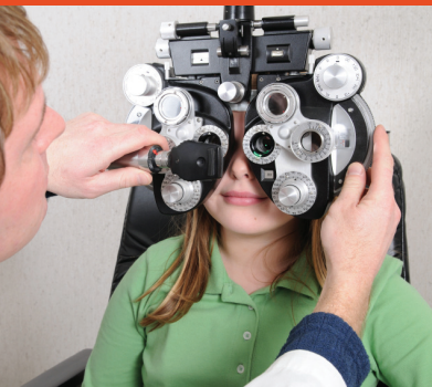
Traditional testing excludes peripheral vision ↻