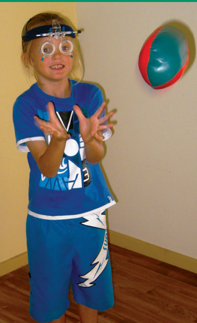
VSI assesses both visions under more natural conditions ↻